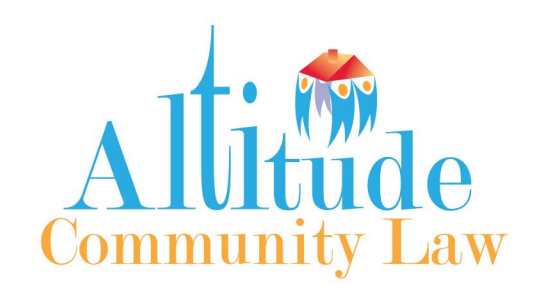
EXHIBIT A TO LEGAL SERVICES AND FEE SUMMARY AGREEMENT FOR 2023 LEGAL COLLECTION SERVICES